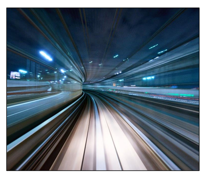
15-16 June 2023 in Copenhagen (Denmark). As a result of all these activities, a manual on the topic will be published on ELA's website in July 2023.

On 26 May, ELA organised an online training focused on Artificial Intelligence and algorithms in risk assessment, addressing bias and other ethical issues. It provided a platform to share knowledge and experience on practical, legal, and ethical issues on using machine-learning tools embedded in artificial intelligence to support national authorities in risk assessment. More than 170 experts from 24 European countries attended the online training, which will be followed by a workshop organised on